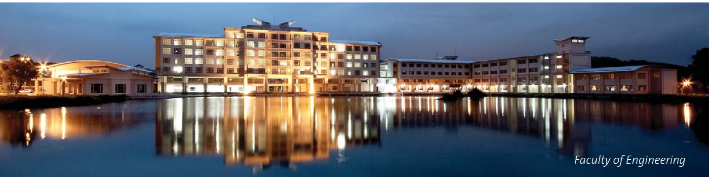
Faculty of Engineering

To make meaningful contributions towards wealth creation, nation building and universal human advancement through the exploration and dissemination of knowledge