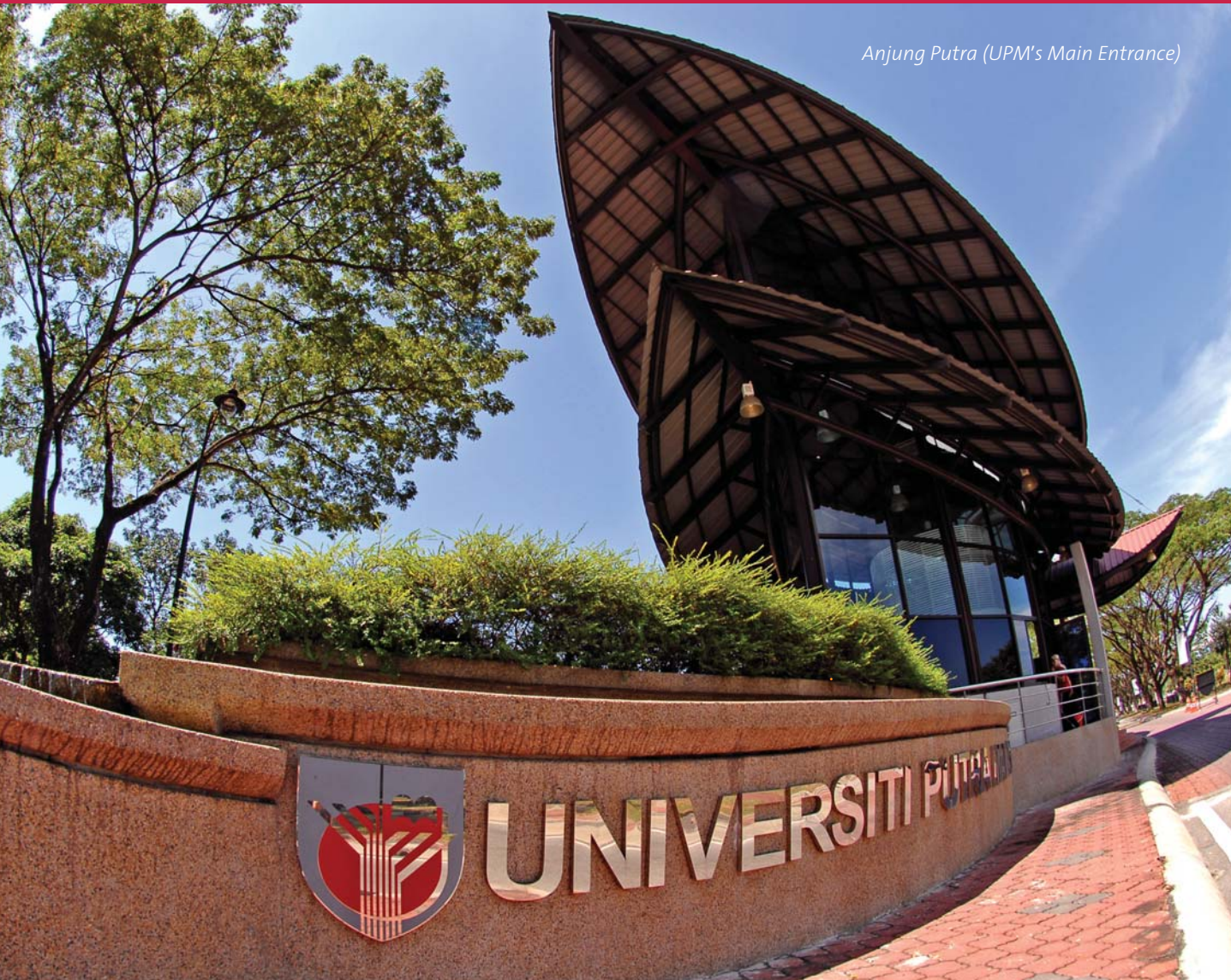
Anjung Putra (UPM's Main Entrance)

Tel : +603 8946 6060 Fax : +603 8942 6469 E-mail : akademik@upm.edu.my